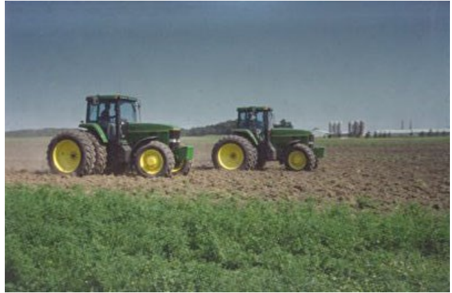
Figure 2. Tire inflation demonstration at MSU's Ag Expo